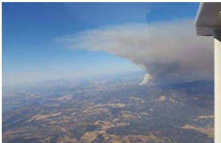
Plume from Marshes Fire

Monday, September 26 th off Hwy 49 and Marshes Flat Road north of Don Pedro Reservoir, the Marshes Fire started at 12:20 in the afternoon. By 3:15, just 3 hours later it had grown to the ominous cloud you see in the photo. I was heading to the Bay Area on business and flew south to avoid the area so that Cal Fire could get their job done. A TFR (Temporary Flight Restriction) was later put into place to keep the area clear for Cal Fire flight activities. The fire was started by a vehicle with a hot engine parked in dry grass. It burned 1,080 acres and took two fire engines, two crews and 92 fire-fighting personnel to contain it. Stats are from www.fire.ca.gov .