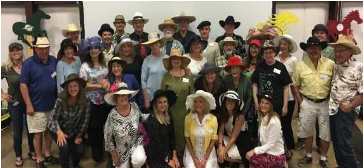
Kentucky Derby Partiers!