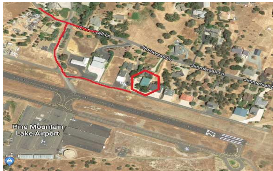
map to Benzing hangar