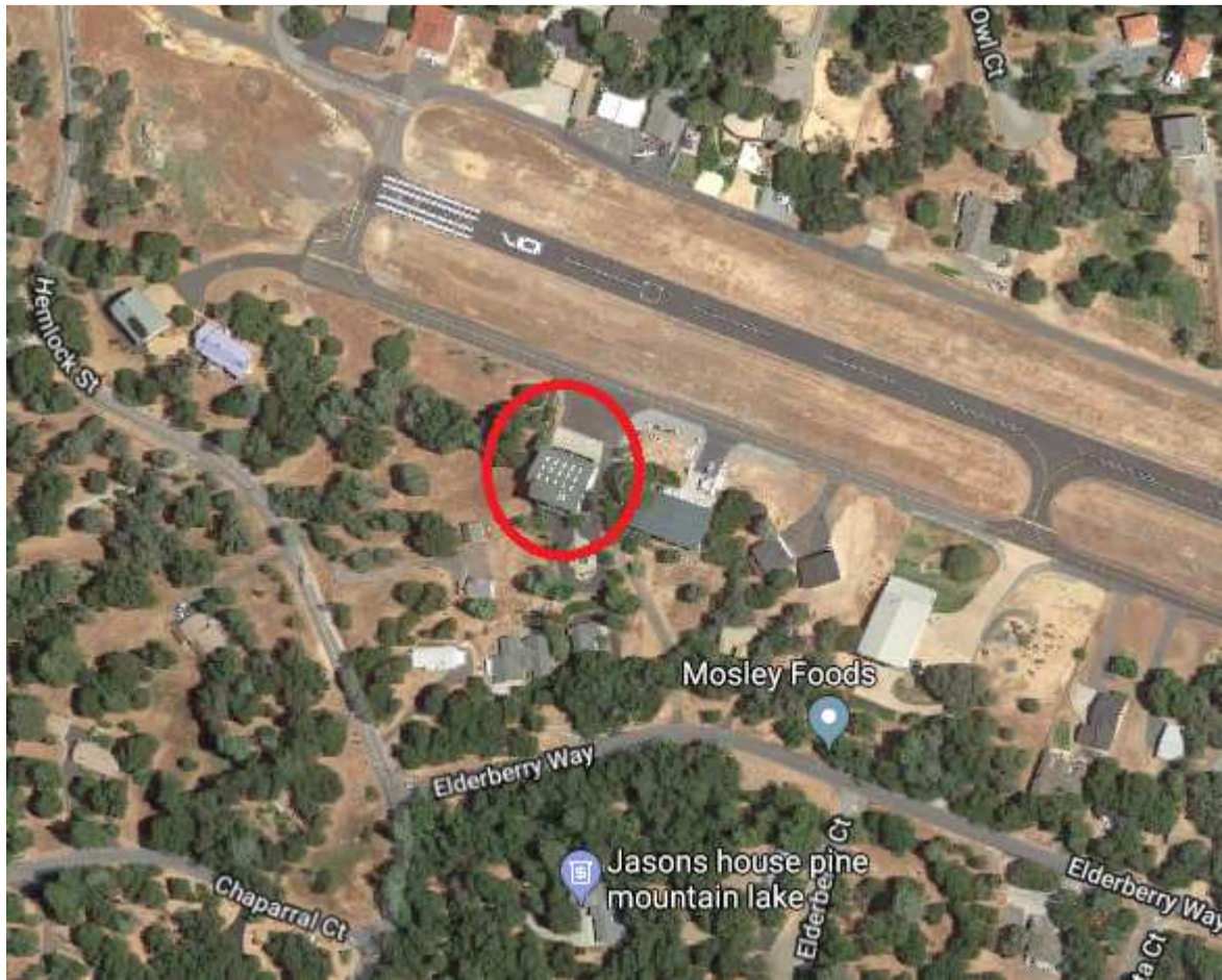
map to Johanson hangar