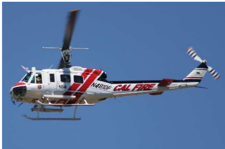
Bell UH-1H "Super Huey"

The Bell UH-1H "Super Huey" helicopters are the most versatile member of the Columbia firefighting team. The Hueys serve multiple purposes: fast initial-attack water/retardant drops, mapping, medical evacuations, short-haul rescue, and delivery of 9-person fire crews to battle fires.