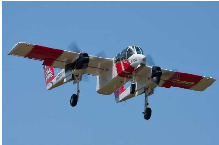
North American Rockwell OV-10 Bronco

PML Airport is a vital firefighting asset for PML, Groveland, Tuolumne County, and CalFire. With our recent evacuation due to the MOC Fire, it really accentuates the critical importance of our airport.