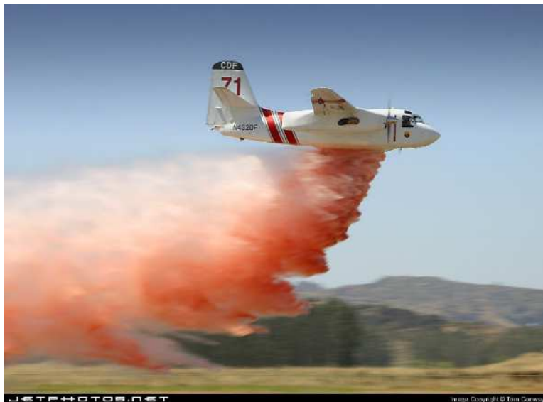
Grumman S-2 Tracker air tanker

In support of the firefighting ground forces, CalFire has 13 air attack and nine helitack bases located around the state. We are fortunate to have a CalFire Air Attack Base so close by. It is located at Columbia Airport (O22). Our local CalFire Air Attack crews respond to fires in Tuolumne and Calaveras counties as well as portions of San Joaquin, Stanislaus, and Alpine counties.