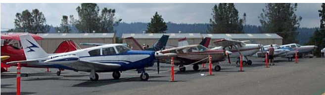
PML fight line