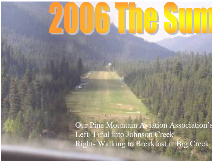
Our Pine Mountain Aviation Association's Idaho Fly Out Left- Final into Johnson Creek Right- Walking to Breakfast at Big Creek