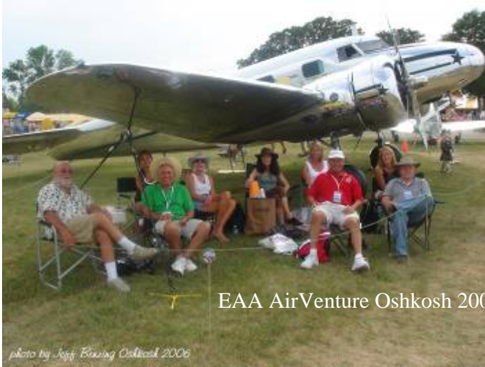
EAA AirVenture Oshkosh 2006