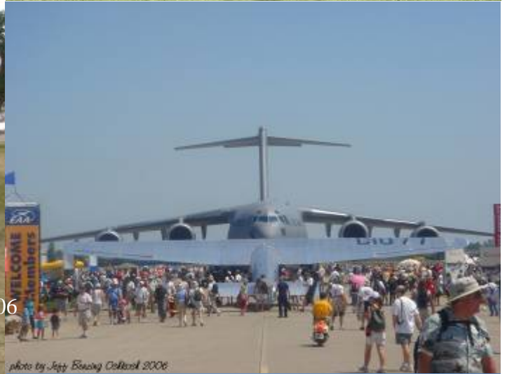
Oshkosh 2006