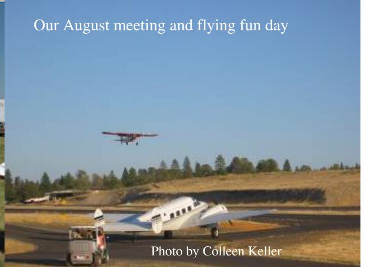
Our August meeting and flying fun day