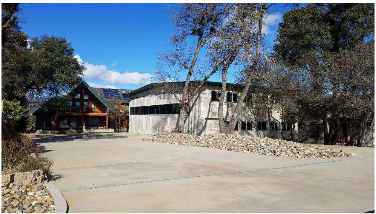
Benzing West Hangar