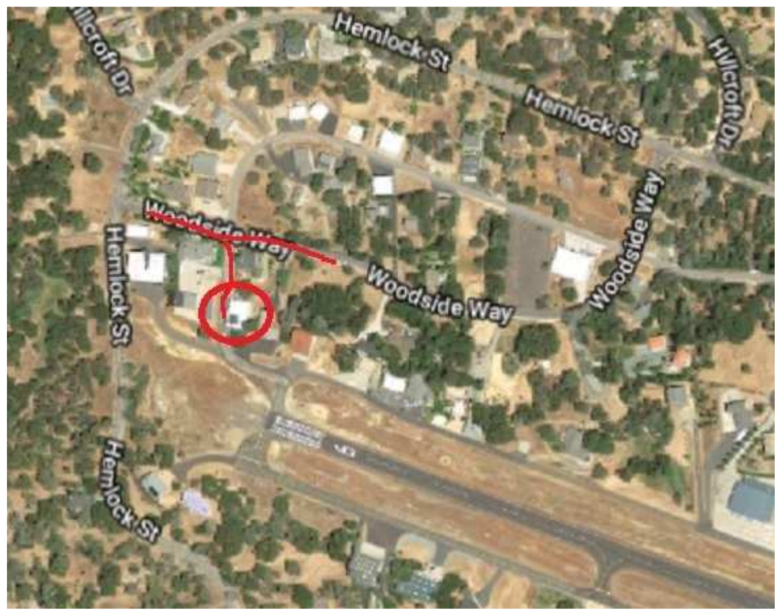
map to Duplan hangar