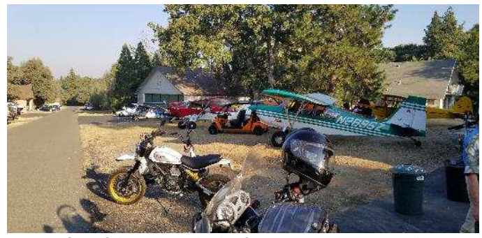
A few of the toys on display from past Hot August Nights

Also, Tenaya Elementary School will be collecting school supplies (or money to buy school supplies) for their students on August 3. Many families in our area cannot afford these items for their children. Since it happens to be the same day as our August PMLAA event, you can bring your donations to the party and we will deliver to the school for you.