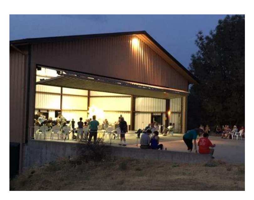
More fun at past Hot August Nights