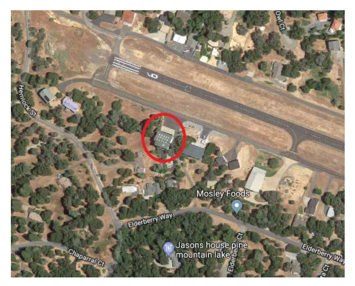
map to Johanson hangar