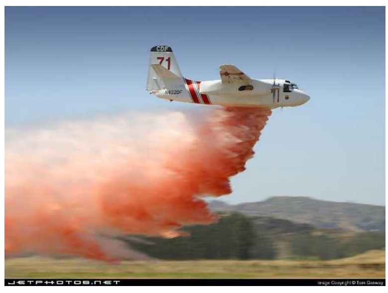
Grumman S-2 Tracker air tanker

In support of the firefighting ground forces, CalFire has 13 air attack and nine helitack bases located around the state. We are fortunate to have a CalFire Air Attack Base so close by. It is located at Columbia Airport (O22). Our local CalFire Air Attack crews respond to fires in Tuolumne and Calaveras counties as well as portions of San Joaquin, Stanislaus, and Alpine counties.