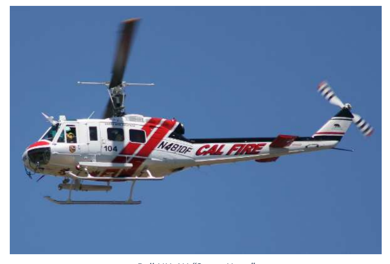
Bell UH-1H "Super Huey"

The Bell UH-1H "Super Huev" helicopters are the most versatile member of the Columbia firefighting team. The Hueys serve multiple purposes: fast initial-attack water/retardant drops, mapping, medical evacuations, short-haul rescue, and delivery of 9-person fire crews to battle fires.