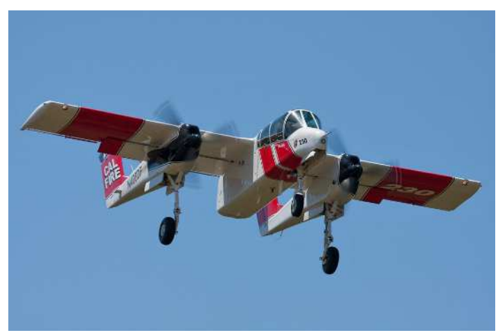
North American Rockwell OV-10 Bronco

PML Airport is a vital firefighting asset for PML, Groveland, Tuolumne County, and CalFire. With our recent evacuation due to the MOC Fire, it really accentuates the critical importance of our airport.