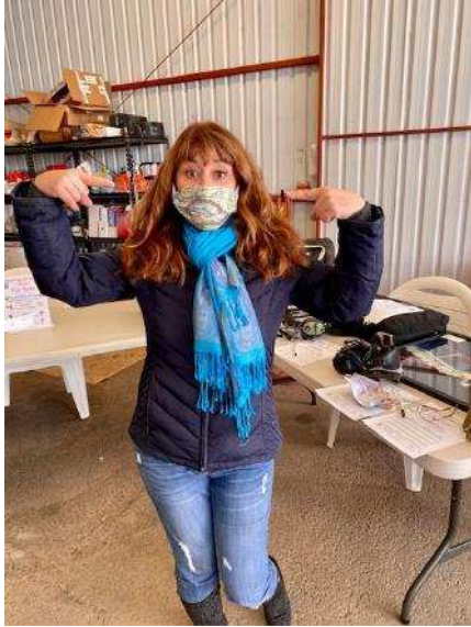
Your President practicing COVID-19 safety.