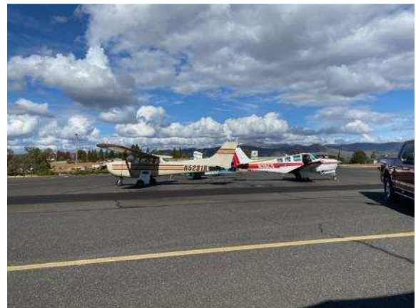
Airplanes on display.