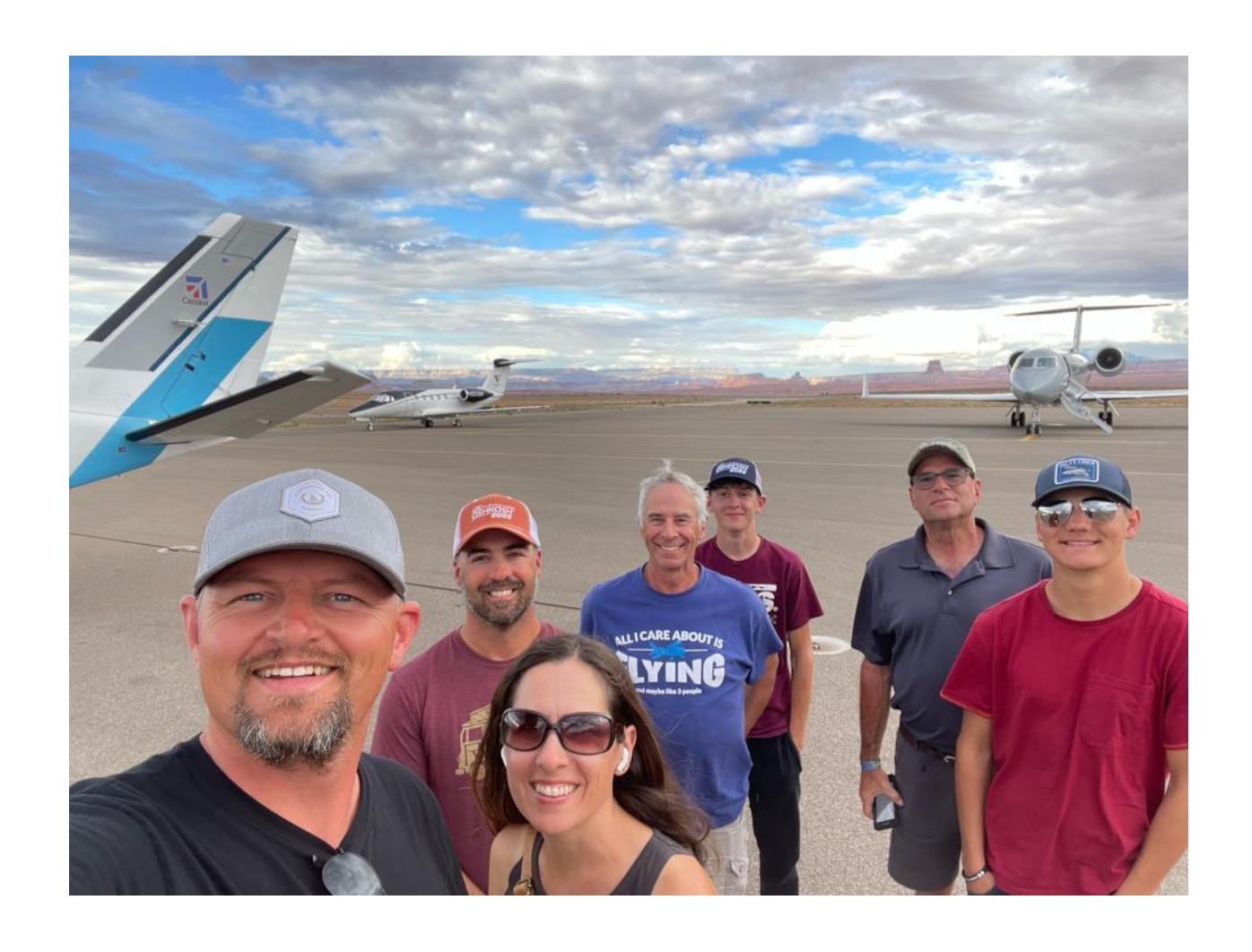
What a fun trip!