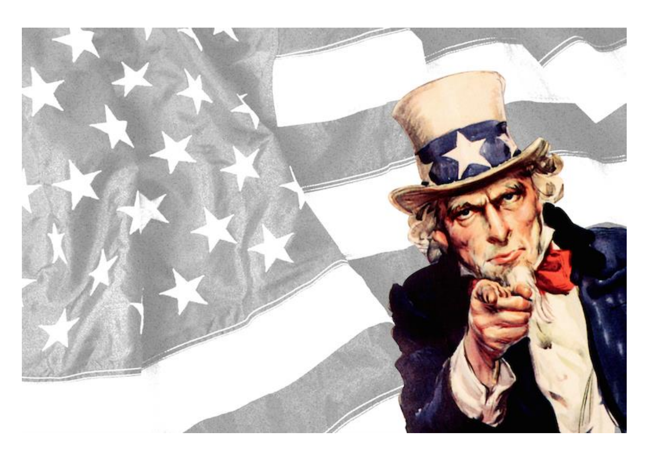
Pine M. Lake Aviation Association wants YOU!!!