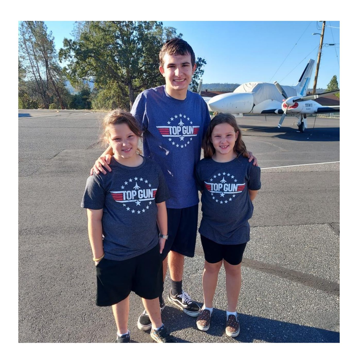
Top Gun Family