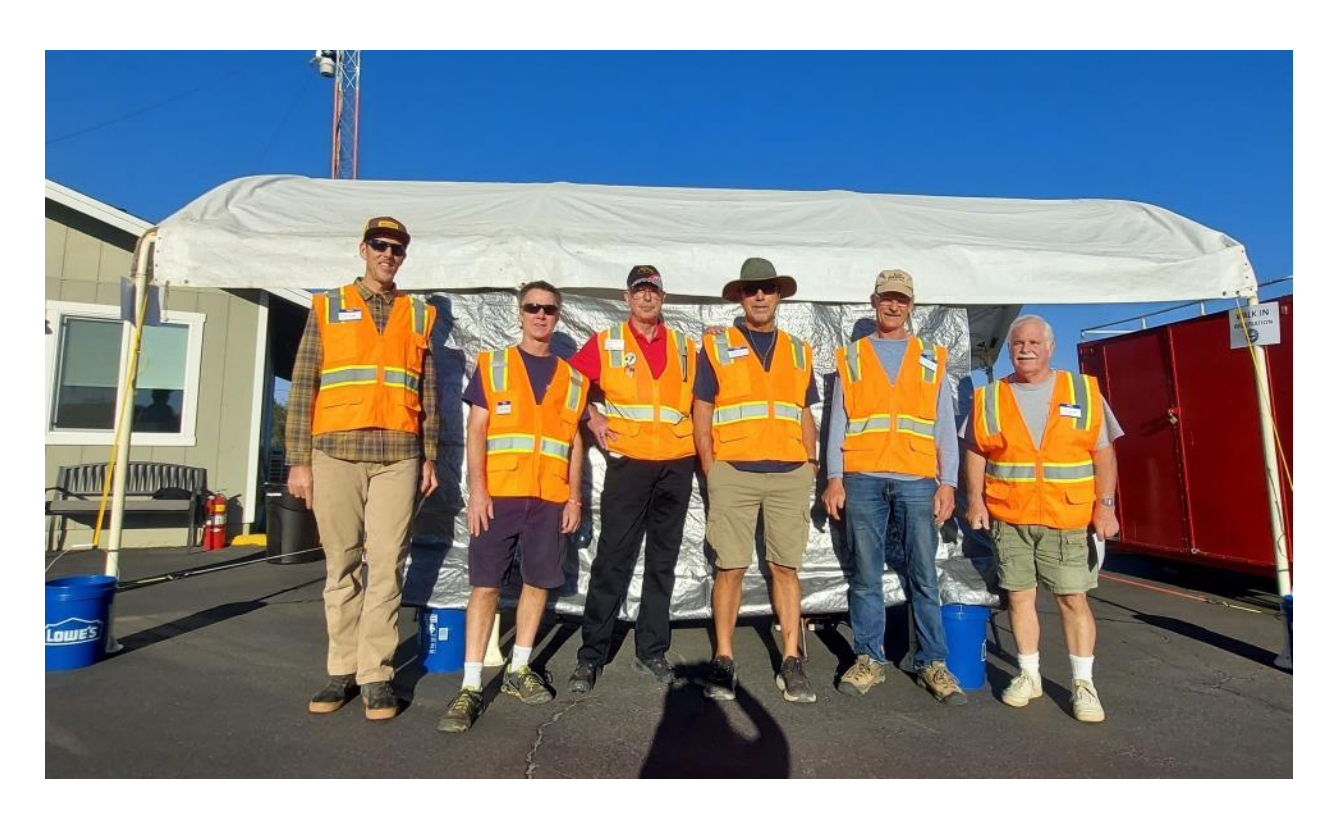
The Ground Crew