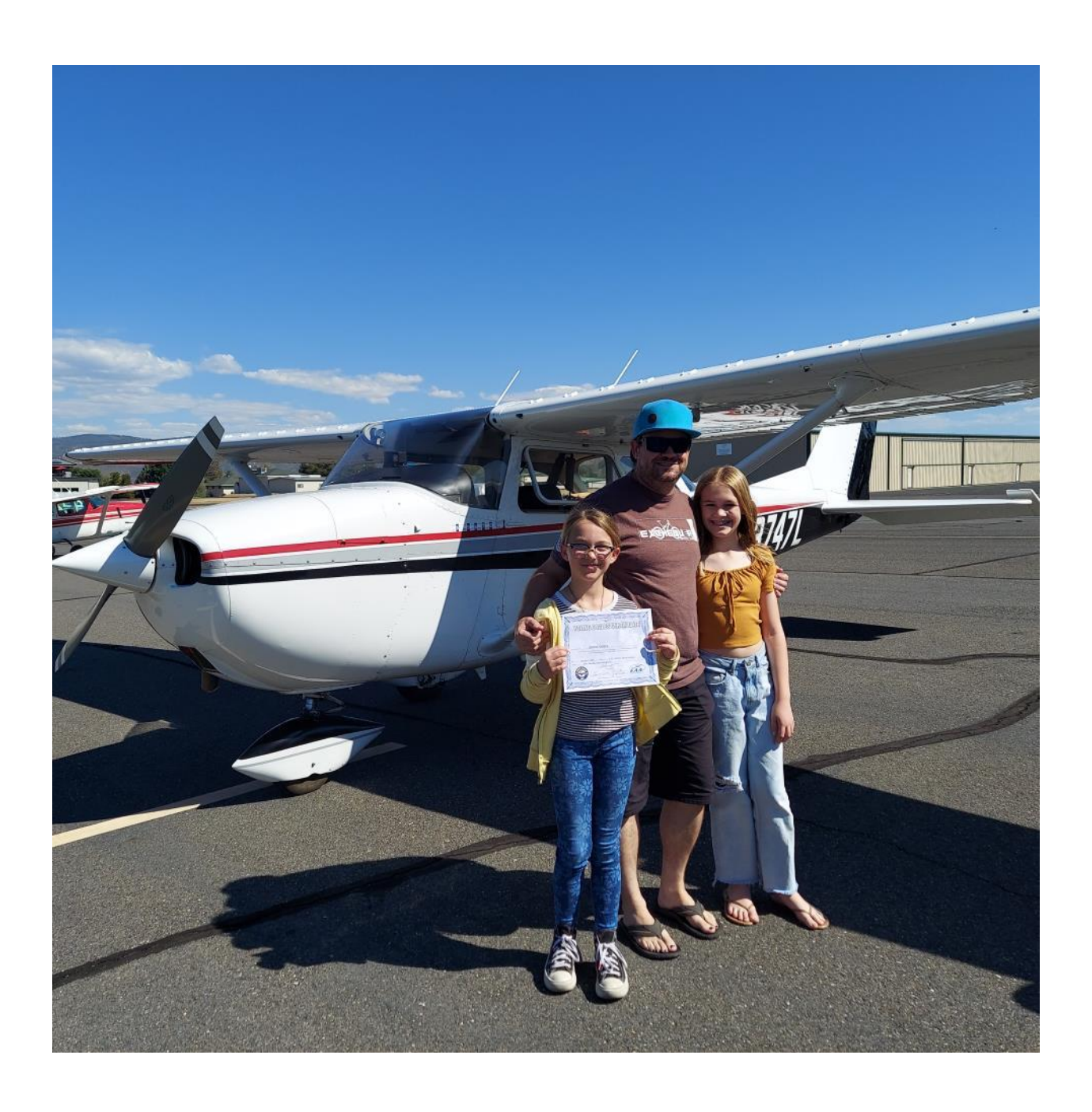
Proud Certificate Holder