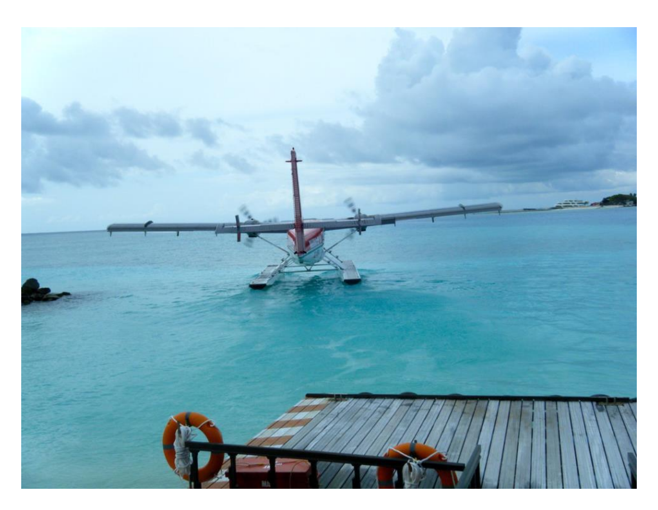
.It may not be all about the airport, but it is all about airplanes. (Ed.)