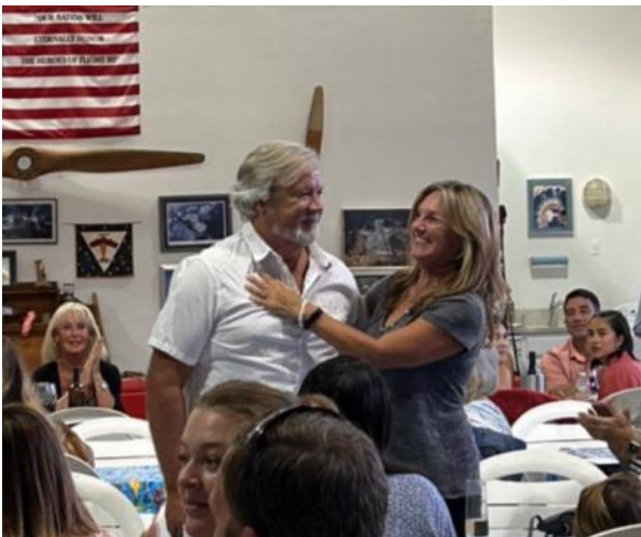
Congrats to the happy couple!